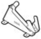
Tool rest for WELDPLAST S2